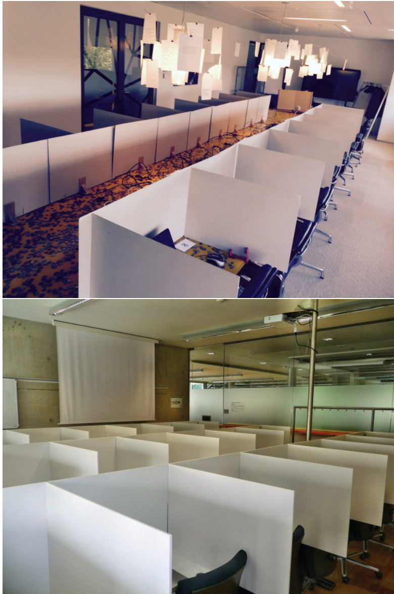
Figure A1: Top: Example of a mobile laboratory in the conference room of a financial institution. Bottom: Innsbruck EconLab.